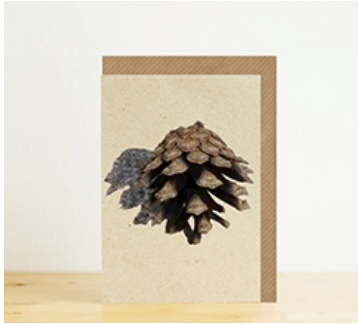
A7 card: Pine cone Unit cost: £0.73 (ex VAT) Stock code: HLS - 039

Helena Lee +44 07939 260273 info@helenaleestudios.com