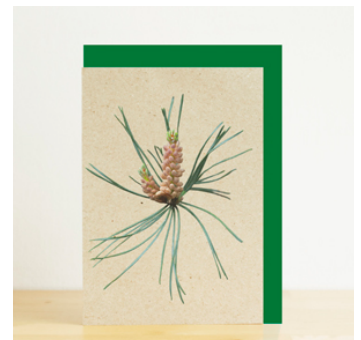
A6 card: Scots pine cone Unit cost: £1.25 (ex VAT) Stock code: HLS - 107