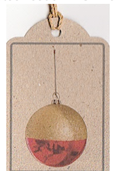
Set of 5 gift tags: Bauble Unit cost: £1.46 (ex VAT) Stock code: HLS - 078

Card size/ Tag size: A6 (105 x 148 mm)/ Set of 5 (50 x 75 mm) Paper weight: 280gsm Card type: 100% recycled from post-consumer waste