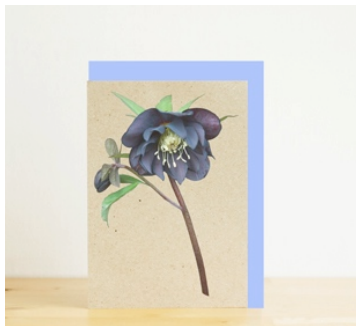
A7 card: Hellebore Unit cost: £0.73 (ex VAT) Stock code: HLS - 108