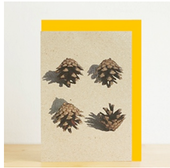
A6 card: Pine cones Unit cost: £1.25 (ex VAT) Stock code: HLS - 013