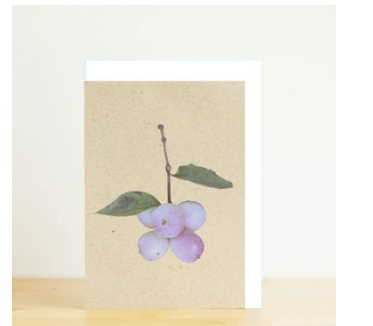
A7 card: Snowberries Unit cost: £0.73 (ex VAT) Stock code: HLS - 163