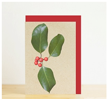
A7 card: Holly Unit cost: £0.73 (ex VAT) Stock code: HLS - 079