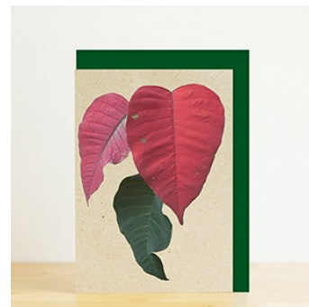
A6 card: Poinsettia Unit cost: £1.25 (ex VAT) Stock code: HLS - 080