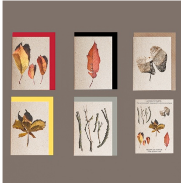
A7 set of 5: Autumn Unit cost: £2.92 (ex VAT) Stock code: HLS - 171