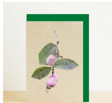
A6 card: Snowberries Unit cost: £1.25 (ex VAT) Stock code: HLS - 162