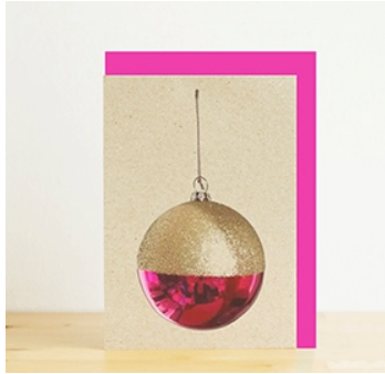
A6 card: Bauble Unit cost: £1.25 (ex VAT) Stock code: HLS - 007

Helena Lee +44 07939 260273 info@helenaleestudios.com