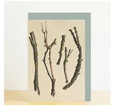
A6 card: Sticks and twigs Unit cost: £1.25 (ex VAT) Stock code: HLS - 035