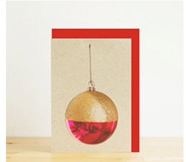
A7 card: Bauble Unit cost: £0.73 (ex VAT) Stock code: HLS - 042