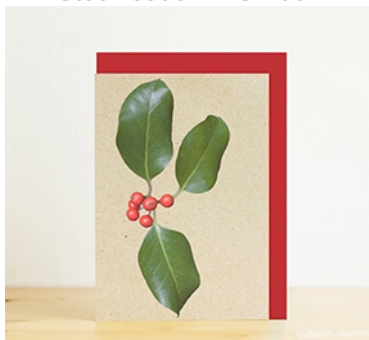
A6 card: Holly Unit cost: £1.25 (ex VAT) Stock code: HLS - 047