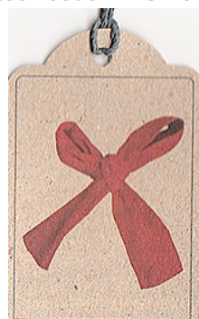
Set of 5 gift tags: Red bow Unit cost: £1.46 (ex VAT) Stock code: HLS - 076