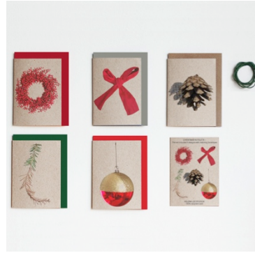
A7 set of 5: Christmas Unit cost: £2.92 (ex VAT) Stock code: HLS - 075