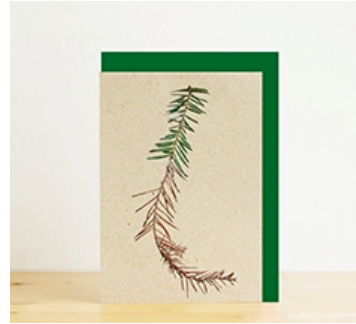
A7 card: Spruce twig Unit cost: £0.73 (ex VAT) Stock code: HLS - 043