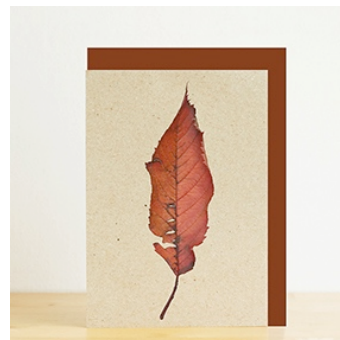
A6 card: Autumn leaf Unit cost: £1.25 (ex VAT) Stock code: HLS - 081