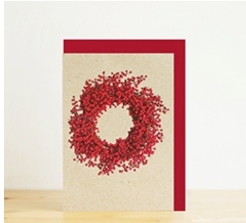
A7 card: Red wreath Unit cost: £0.73 (ex VAT) Stock code: HLS - 040