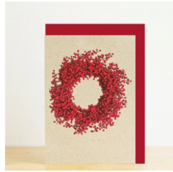
A6 card: Red wreath Unit cost: £1.25 (ex VAT) Stock code: HLS - 015