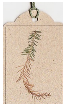
Set of 5 gift tags: Spruce twig Unit cost: £1.46 (ex VAT) Stock code: HLS - 077