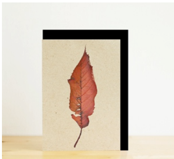
A7 card: Autumn leaf Unit cost: £0.73 (ex VAT) Stock code: HLS - 083