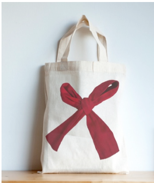
Mini tote: Red bow Unit cost: £3.54 (ex VAT) Stock code: HLS - 110